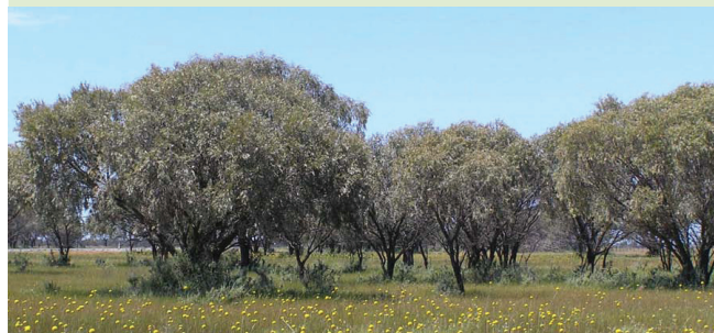
Ecosystems are important to Agricultural production

Over the last decade there has been a very large amount of policy-focussed research related to maintaining and improving the delivery of ecosystem services from agriculture. In contrast, the value of ecosystem services to agricultural production has received very little attention.