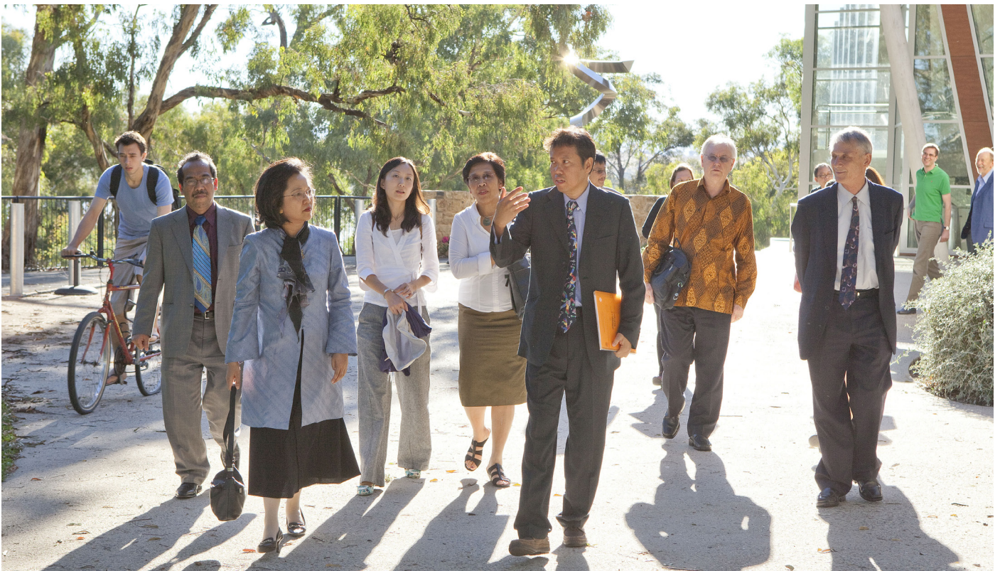
Indonesian Minister Armida Alisjahbana met with Indonesia Project and delivered a public lecture.