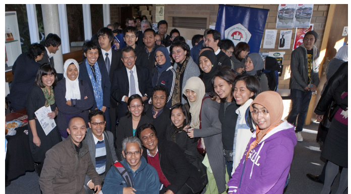
Indonesia's former Vice President Jusuf Kalla delivered a Public Lecture as part of the Indonesia Study Group program.

Twenty-five ISG meetings were held in 2010/11. Twelve speakers came from ANU, four from other Australian universities, seven from institutions in Indonesia, and two from institutes elsewhere in the world (Singapore and the United Kingdom). There were nine female presenters. Topics included foreign policy; demographic issues; labour migration; health policy; infrastructure policy; oil palm policy; threats to the current rice crop; the implications of illegal logging for deforestation and forest degradation; corruption eradication; an attempt to explain developments in the Prosperous Justice Party; analyses of the Bank Century case and of the controversy surrounding the Islamic minority sect Ahmadiyah; perspectives on human rights and special autonomy in Papua; and studies of terrorist rehabilitation and of Islamic pilgrimage in Bali.