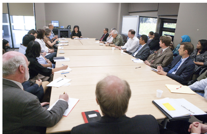
Indonesian Trade Minister Dr Mari Pangestu during a roundtable meeting with Indonesia Project and ANU academics.

Project staff have produced numerous papers on trade policy – in