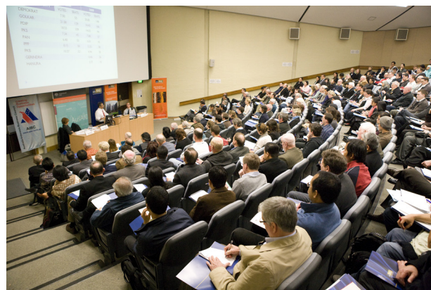
During the Indonesia Update Conference 2009.

The book based on the conference, edited by Robert Cribb and Michele Ford and also entitled Indonesia Beyond the Water's Edge: Managing an Archipelagic State , was published in 2009.