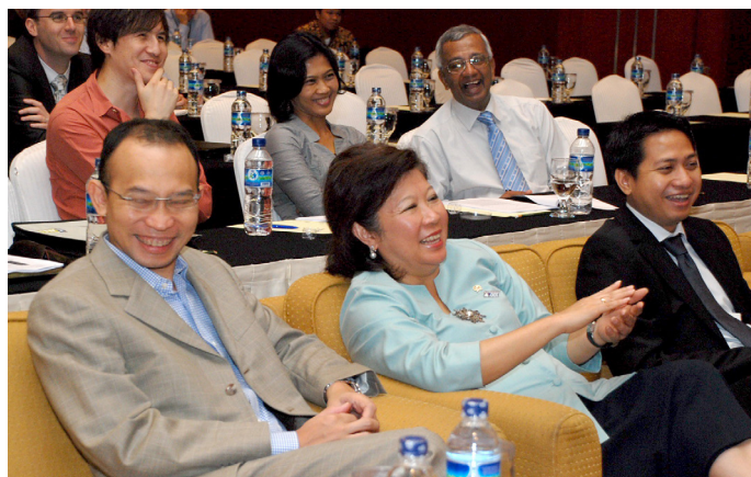
Dr Chatib Basri, Dr Mari Pangestu and Dean of Faculty of Economics University of Indonesia, Dr Firmanzah during the 2009 Sadli Lecture in Jakarta.