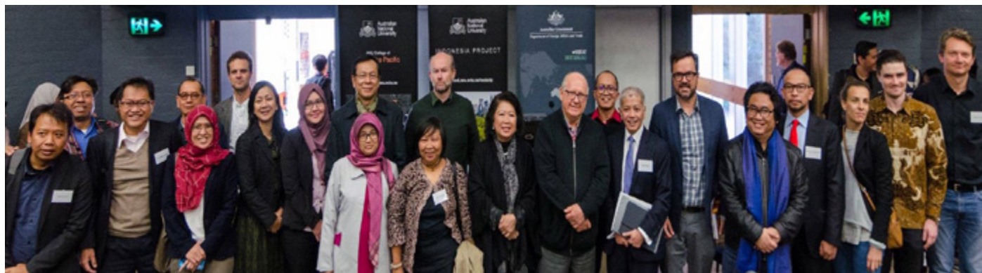
Speakers, chairs and convenors of the 2017 Indonesia Update on globalisation, nationalism and sovereignty

Overall 2017 was a highly productive year for the Project. The Project looks forward to an equally productive 2018 as it continues to pursue its aim of contributing to the creation of stronger, research-based public policies in Indonesia.