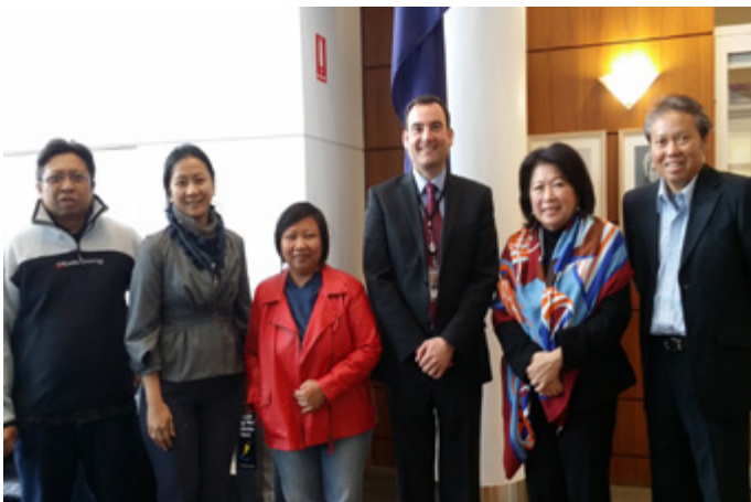
A meeting with DFAT in conjunction with the Indonesia Update.