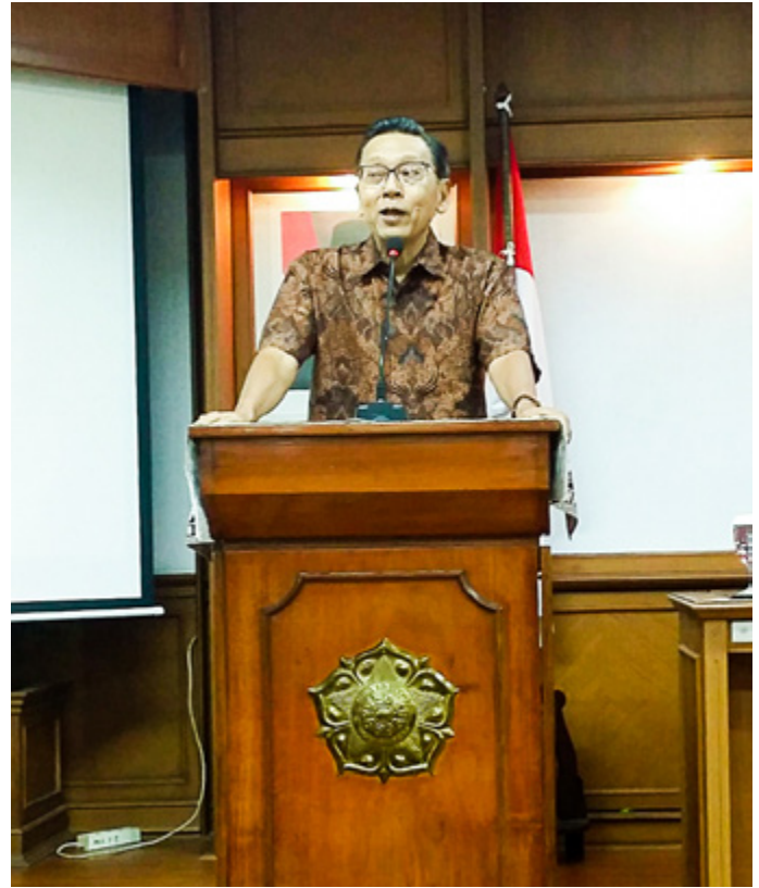
The first Mubyarto Public Policy Forum with Indonesian former Vice-President Boediono as Keynote Speaker.