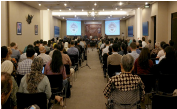
Digital Indonesia book discussion during the Hadi Soesastro Policy Forum.