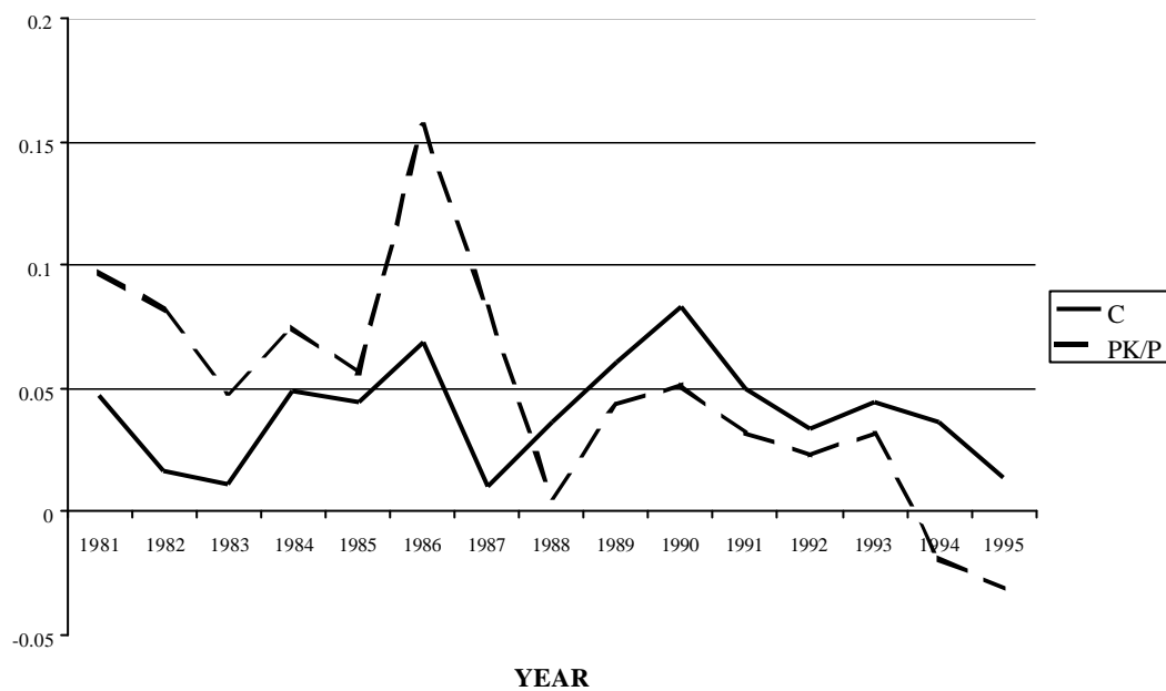
Figure 2: Behaviour of Cost of Capital (C) and the Relative Price of Capital Goods (PK/P), 1981-1995